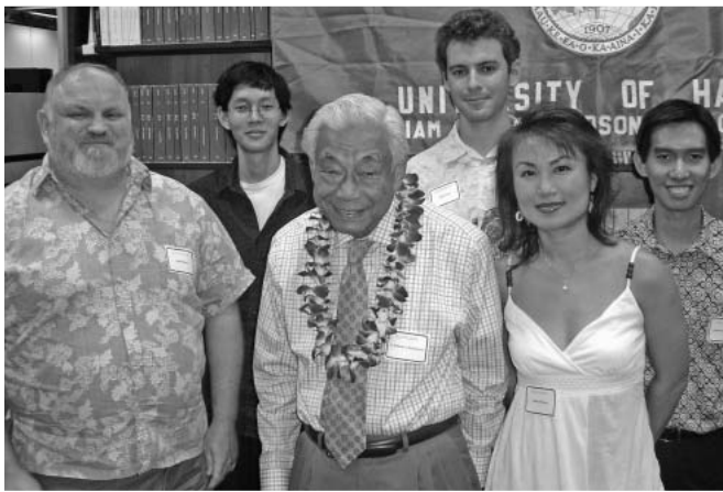
Alumni Association Representatives present scholarships to three students who have demonstrated a commitment to public service.