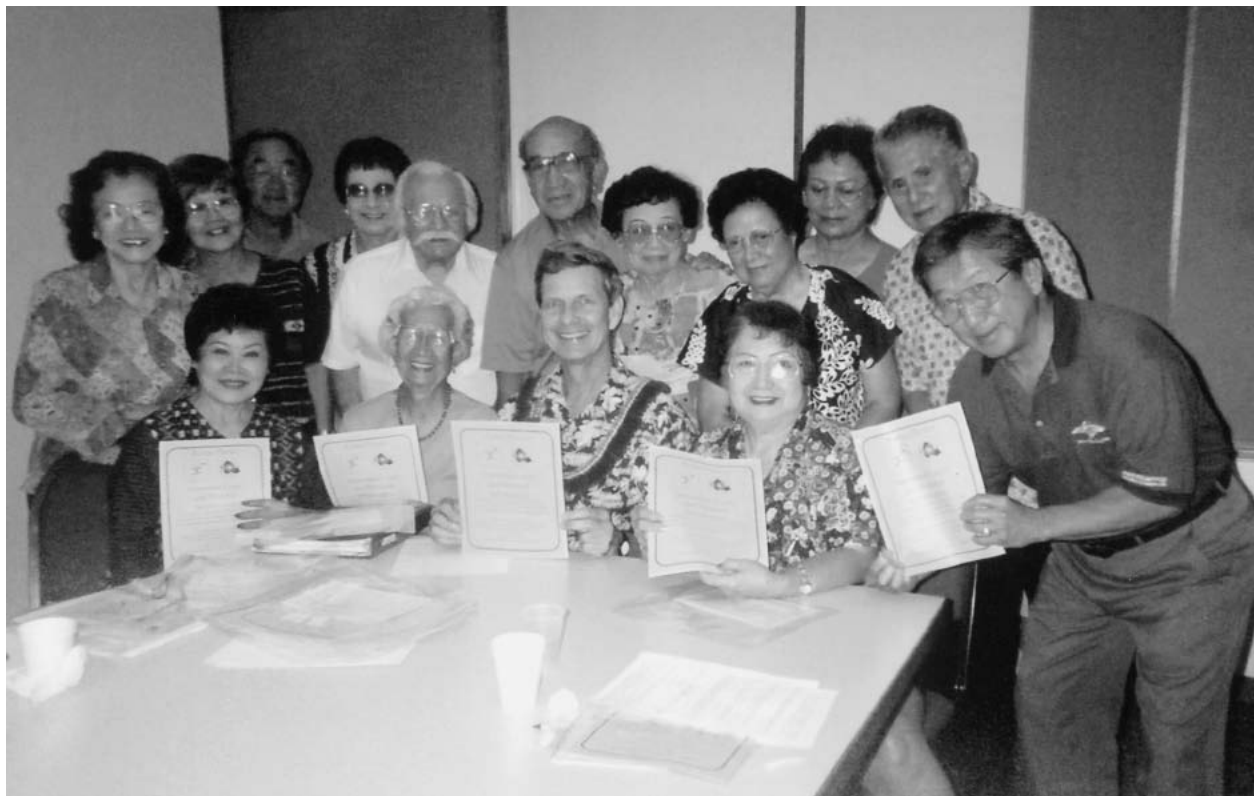
The Law School's Elder Law Clinic Helping Hawaii's Seniors